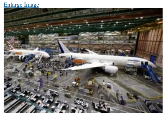
Industrial companies in the S&P 500 are expected to report strong profit growth in the fourth quarter. Consensus estimates have airplane maker Boeing's per-share earnings climbing 7.1%.